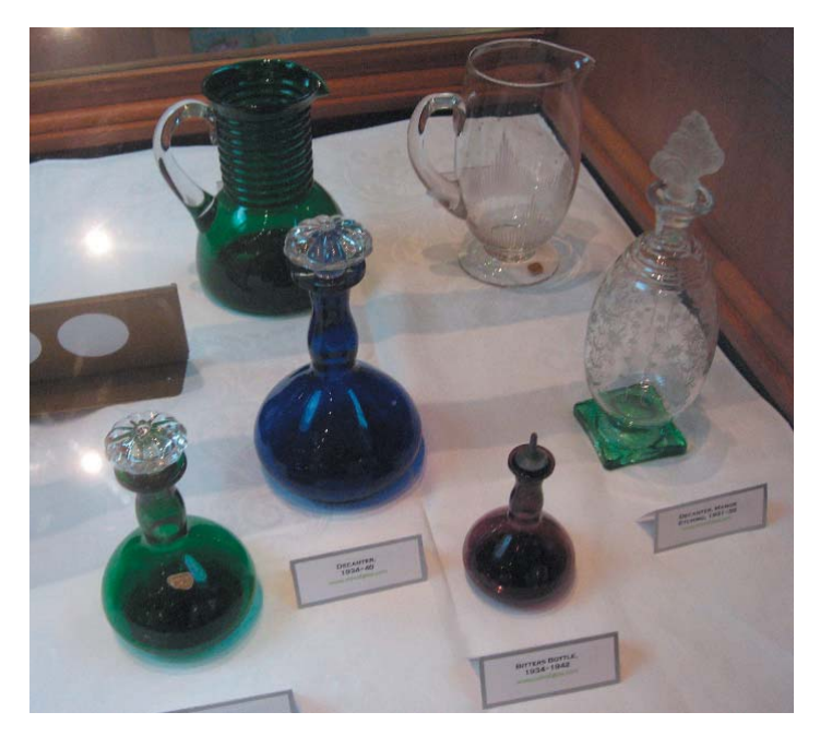
Portland's Rain of Glass exhibit at Multnomah County Library in the Collins Gallery