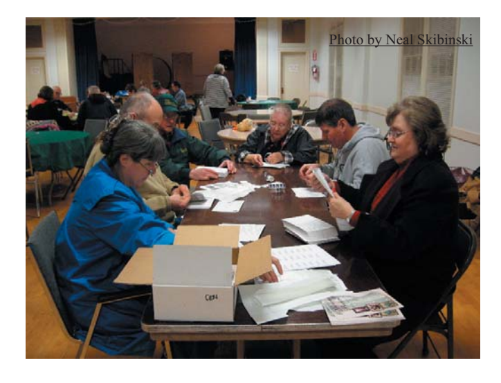
Label Sticking Party after the General Meeting